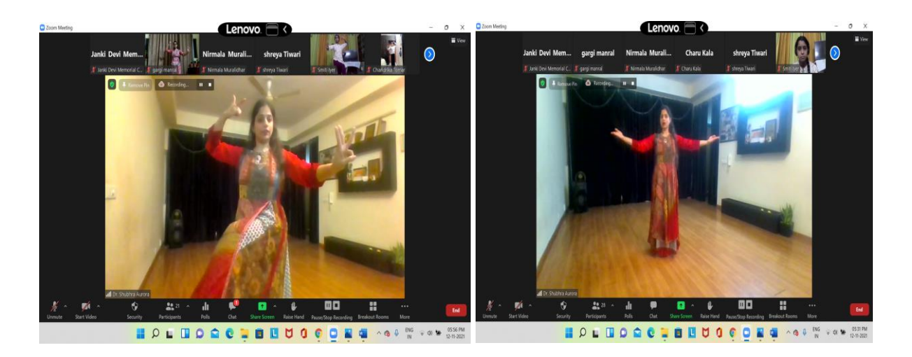
Glimpses of the Kathak Workshop on 12 November 2021