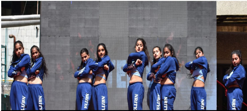
Secured 3rd position at Fore School of Management