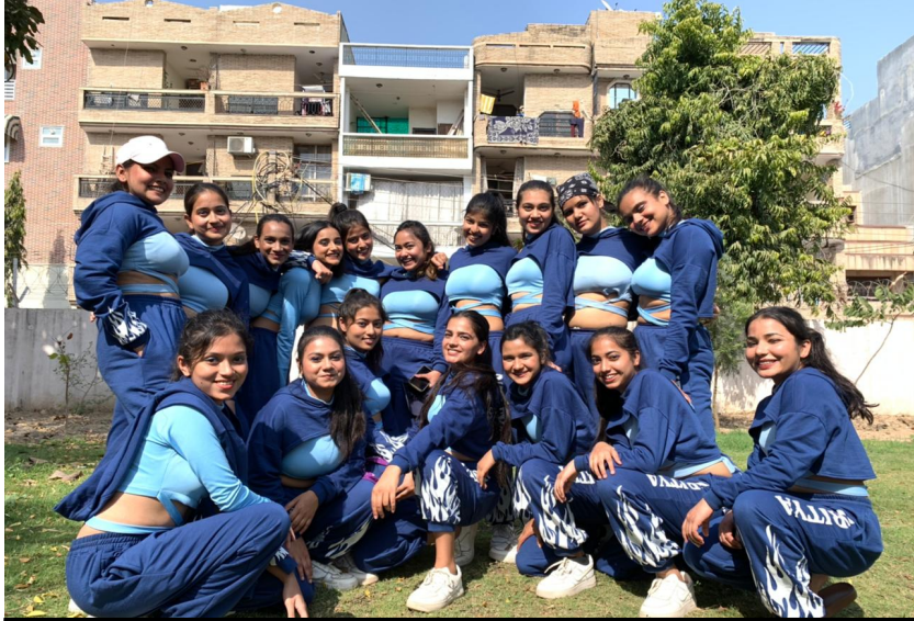
Secured 3rd position at Deshbandhu college