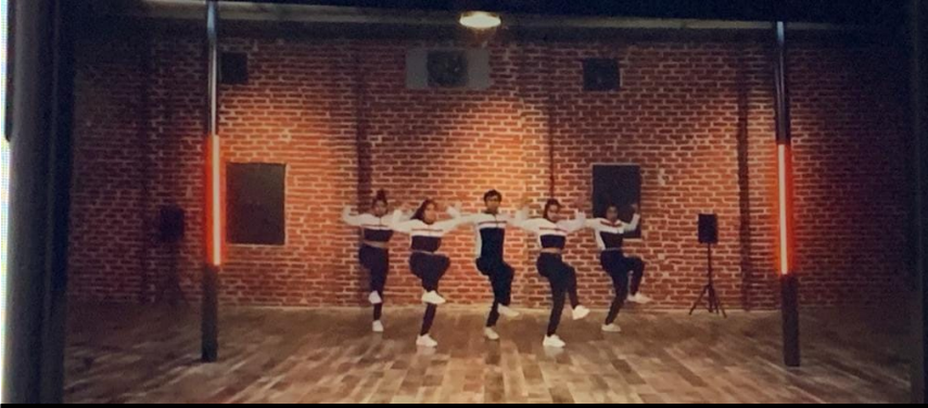
Participating team at FOOTLOOSE '2022