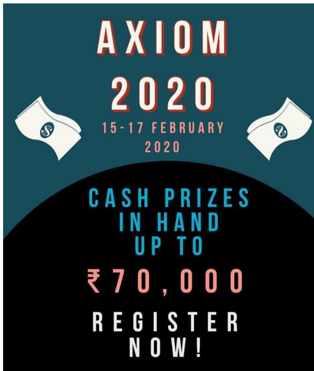
Poster of Axiom 2020 held from 15 February 2020 to 17 February 2020