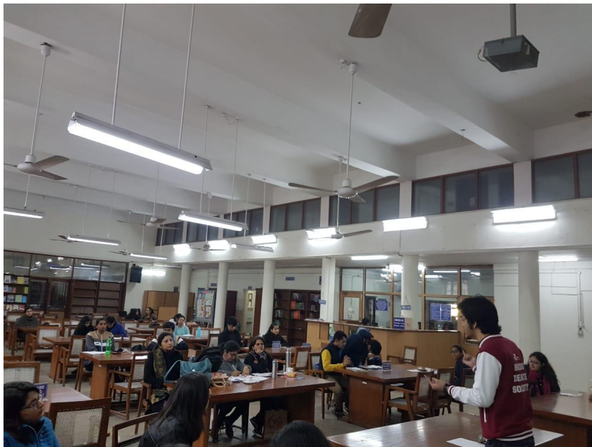
Jabberwocky: Turncoat Debate Competition held as a part of Symphony 2020 on 9 January 2020