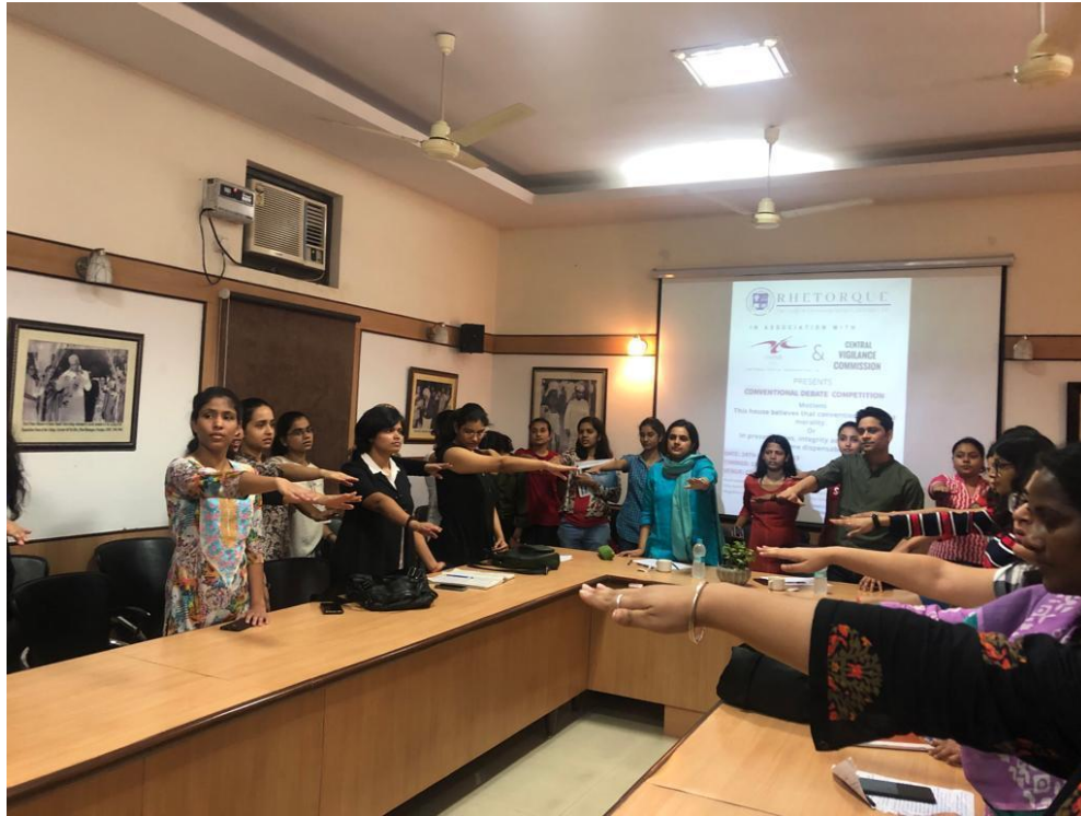
The Judges, Participants and Audience Taking the Integrity Pledge during the Vigilance Debate Competition Organised by Rhetorque in Association with NTC on 24 October 2019.