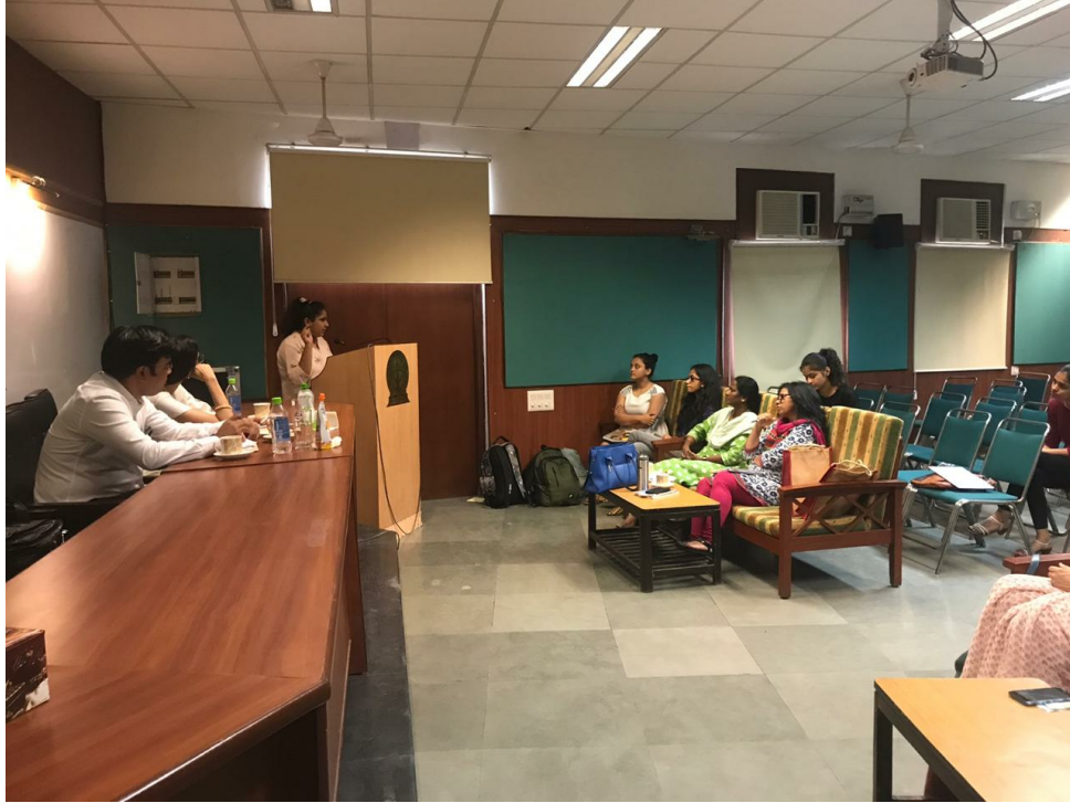
Bilingual Declamation Competition to Celebrate Independence Day held on 14 August 2019