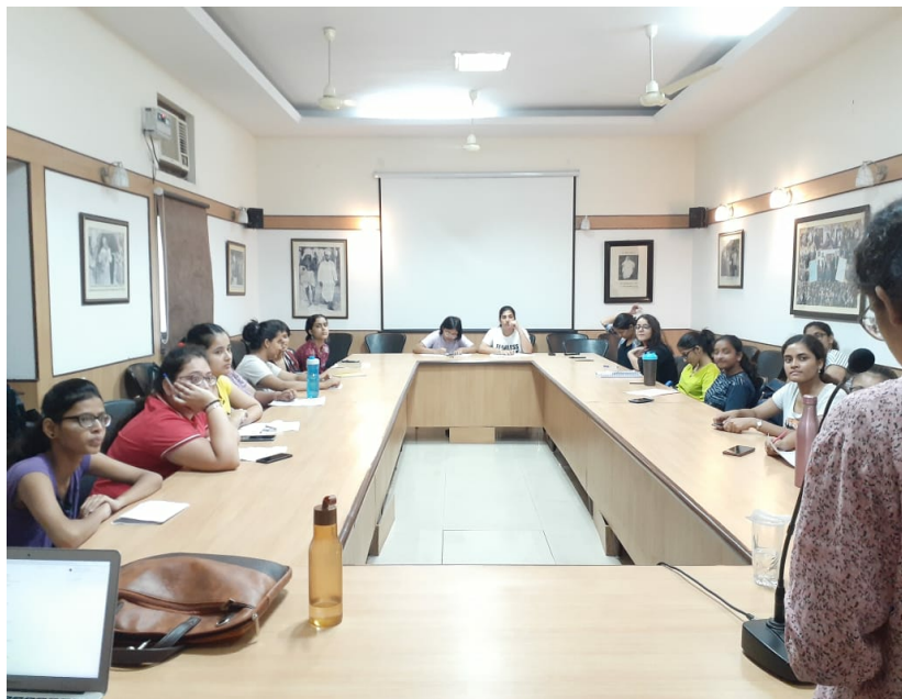
Round One of the Freshers Debate which was held on 17 September 2019