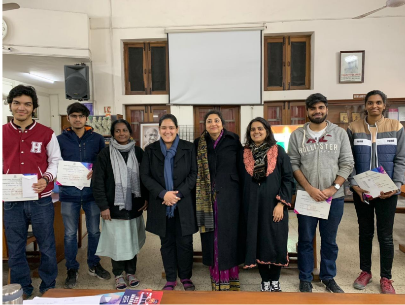
The Judge and Prize Winners of Jabberwocky: Turncoat Debate Competition held as a part of Symphony 2020 on 9 January 2020 with the Convenors of Rhetorque