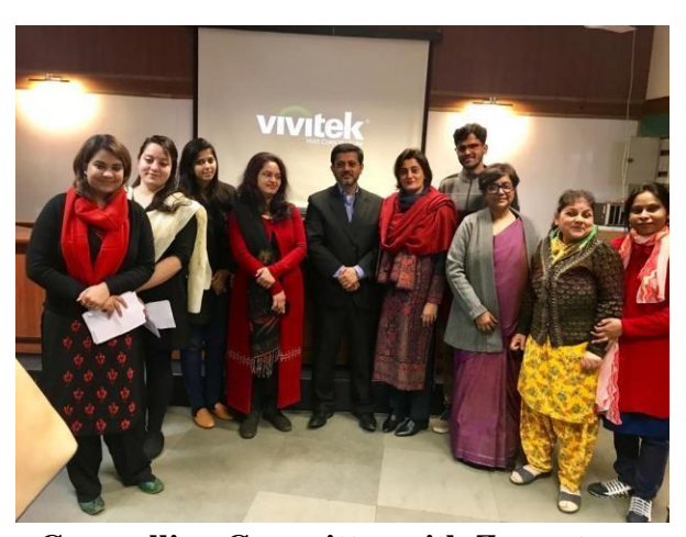
Counselling Committee with Zyego team

Workplace is where a person spends a considerable amount of time and hence forms a part of the person's microsystem. Keeping the importance of the same in mind, an interactive session was conducted by Zyego on 24th January 2018 on the topic, Hot Talk on "Interpersonal Relationships at Workplace" and how to handle issues concerning protocol, hierarchy etc. The workshop was organized for the faculty members of the college. It witnessed participation facross all the departments. A total of 144 faculty members were present. The session began with understanding the importance of team work. This was followed by discussion on building effective interpersonal relationships. Reflection on how one can be a supportive team member was then undertaken. The session also included various fun and interactive activities. This was followed by a question and answer round wherein teachers shared their questions, reflections and experiences. This session was received very well by all the teachers.