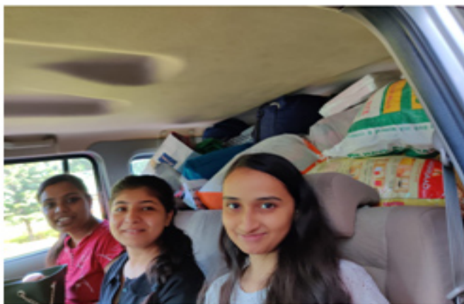
Team Avani assists in donating for Bihar Floods- October 5, 2019