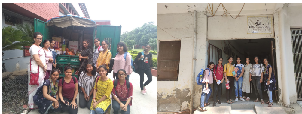
Avani sends its contribution to Goonj-August 27, 2019

The team Avani successfully delivered its collection to the NGO, Goonj on August 27, 2019. The students and faculty members actively participated in collecting old clothing, shoes, edibles, and stationary for donating to Goonj. Around forty students from the team Avani assisted in this task. The association of Avani with Goonj is not new. It continuously donates to Goonj, reflecting commitment to serve humanity and saving the environment. For Goonj recycles old clothes and distributes it among the rural poor. Also, it makes items like bags for sale in the market and the income generated from it is used for providing education to children in the rural area.