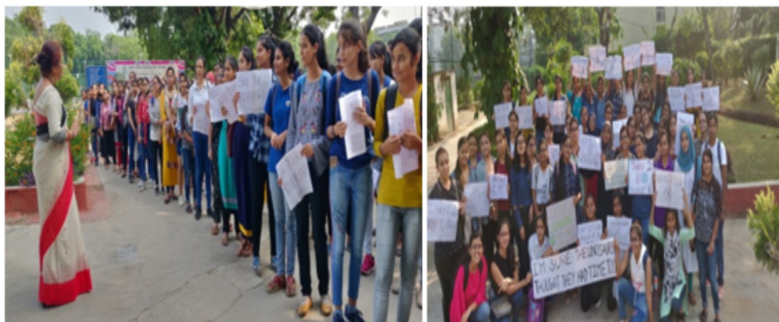
Climate March-October 4, 2019