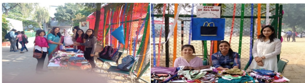
Avani sells Cloth Bags-October 21, 2019

The team Avani in keeping with its mission to fight plastic waste set up stalls to sell cloth bags during the Diwali Mela, Jyotsna and the North East Festival on October 21, 22 and 31, 2019. The stalls were a part of Aao Bag Banaye component of Avani. The team Avani successfully sold cloth bags to the faculty members and students reiterating its commitment to create a plastic free environment. A sum of Rs. 3000 that was collected from the sale of the cloth bags was given to the Student Aid Fund, JDMC.