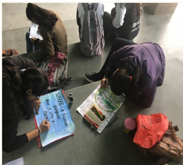
Slogan Writing Competition – January 22, 2020

A Slogan Writing Competition with theme of Water Conservation was organised on January 22, 2020 by National Service Scheme (NSS) in collaboration with Avani as a part of Swachta Pakhwada drive. The competition spread the message and generated awareness about the urgent crisis of water shortage and hence, the need for conserving it.