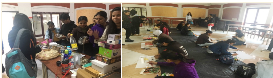
Create from Waste Competition-January 10, 2021