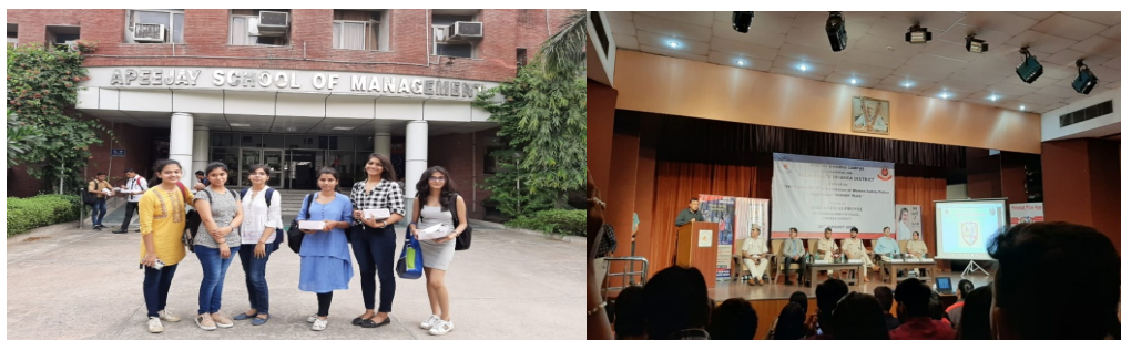
Avani Students at the Youth Summit- August 30, 2019