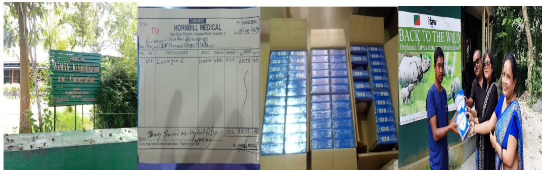
Avani Assists in Saving the Rhinos- August 5,2019

of team Avani was highly appreciated by the local people and animal lovers of the state of Assam.