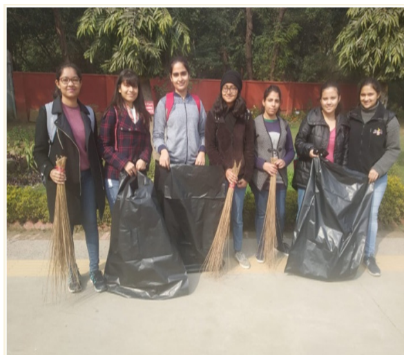
Cleanliness Drive-January 22, 2020

As a part of Swacchta Pakhwada drive students from team Avani participated in cleanliness drive on January 22nd, 2020. The students were given broom and poly-bags to clean the college campus.