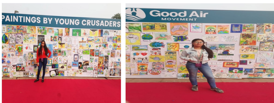
Avani Students Participate in Good Air Summit-November 13, 2019

The students from team Avani participated in the Good Air Summit on November 13, 2019 at Jawaharlal Nehru Stadium, Delhi reflecting the responsibility of the youth for saving environment. The summit through various mediums paintings, dance performances, painting and skits informed students to regarding Delhi's deteriorating environment and air pollution and its implications on the health of the residents. Further, the summit included a panel discussion by environment experts like Justice Swatantra Kumar, former chairperson of National Green Tribunal and Shri Chintu Kwatra, founder of Beach Warriors and Khushiyaan Foundation, which encouraged students to take lead in making their city air clean and pollution free.