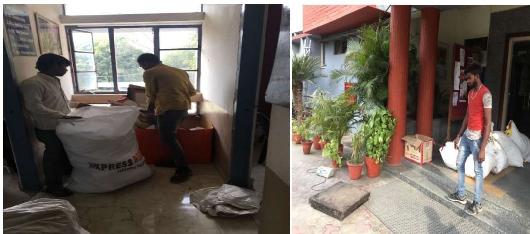
Paper Waste Collectors from Green-O-Tech India at JDMC- February 19, 2020

On February 19, 2020 Avani the Environment Club dispatched 254 kilograms of paper waste for recycling to the Paper Recycling Company, Green-O-Tech India. The waste paper recycling activity of team Avani is an excellent example of a green initiative of converting waste to wealth.