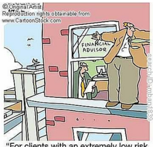
"For clients with an extremely low risk tolerance, I recommend they talk to someone with a ground-floor office."