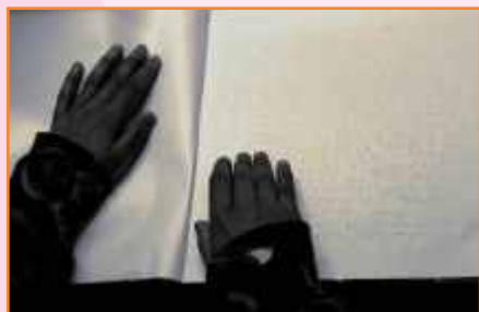
Enabling the Differently Abled