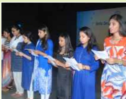
Students' Union Investiture Ceremony