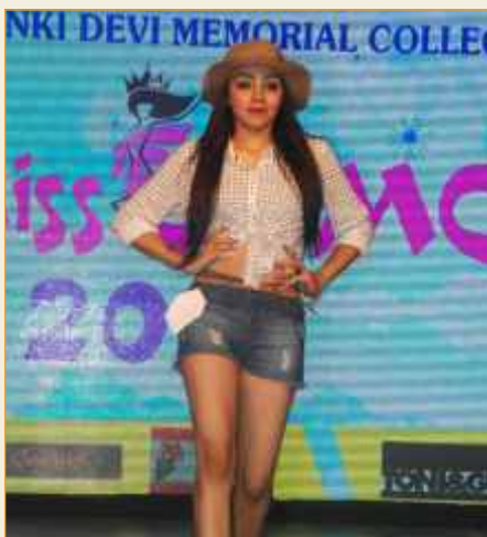
Miss JDMC Contest