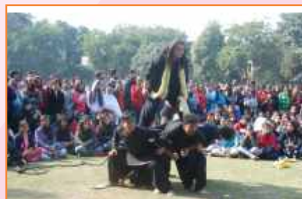
Street Play at the College Fest