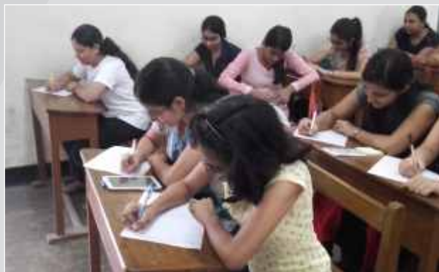
Iridescent- Creative Writing Competition