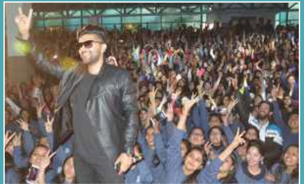
Rock Show - Symphony