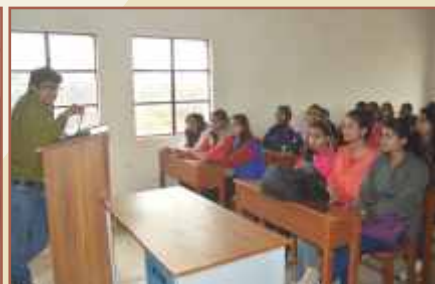
History Dept. Seminar- Student Interaction