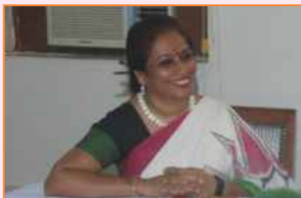
Principal at the College Library Fest