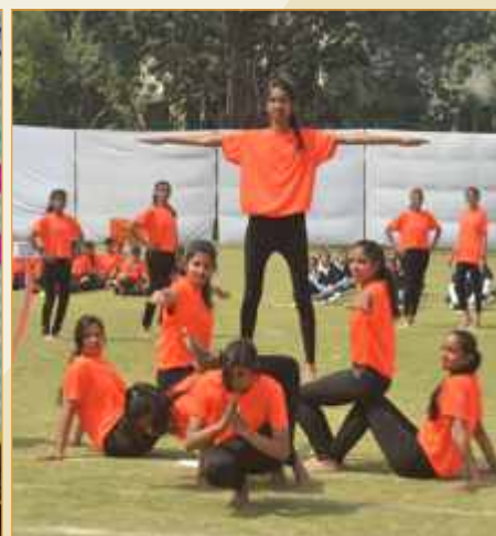
Acrobatics on Sports Day