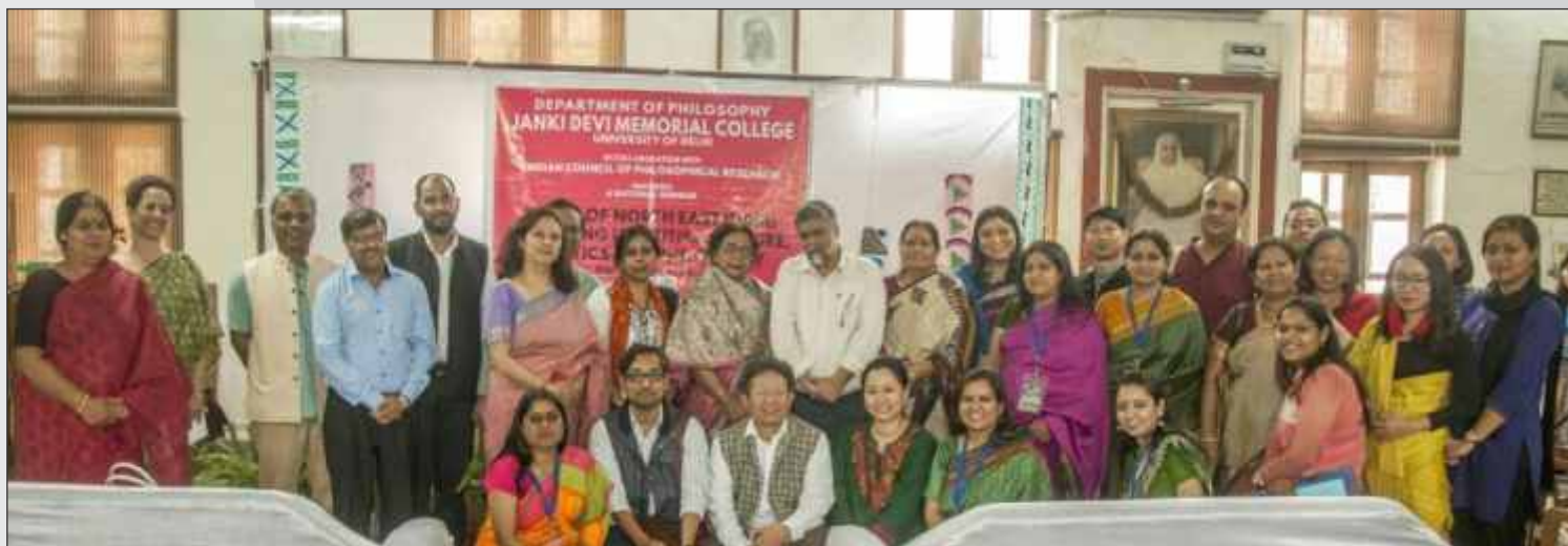
Dept. of Philosophy National Seminar