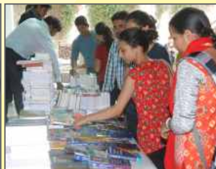
Books- Different Versions of the World