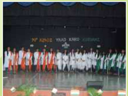
Celebrating 70 Years of Independence