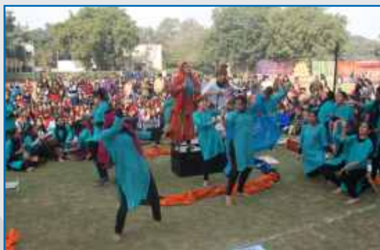
Students Performing at the College Fest