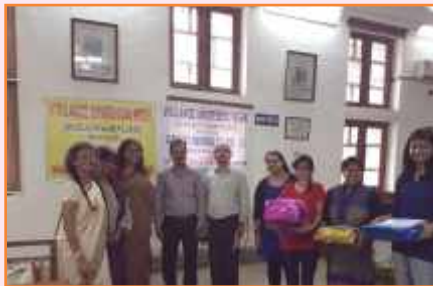
Winners of NTC and SIDBI with organisers