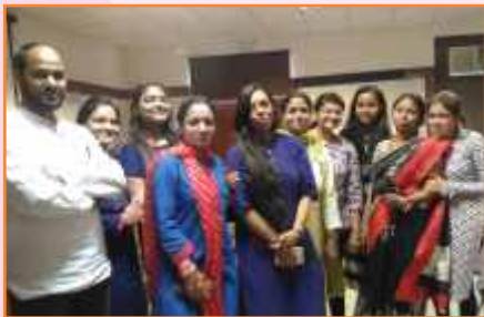
An Inspiration for All- Talk by an Acid Attack Survivor