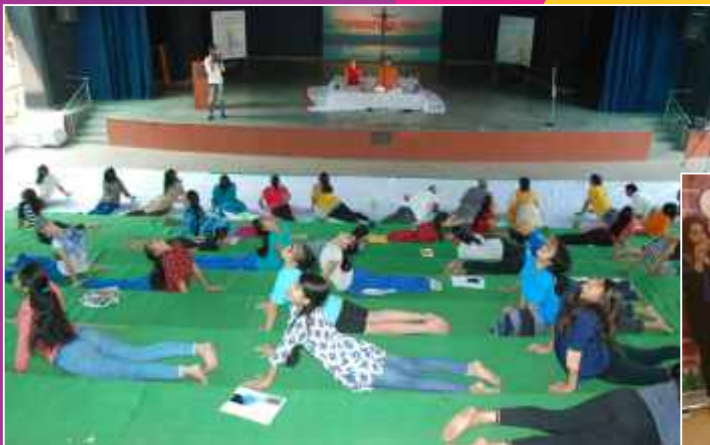
Yoga - Elixir of Life