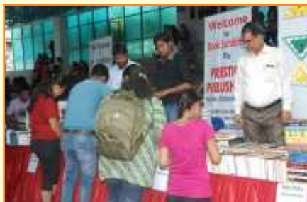
Book Lovers having Fun