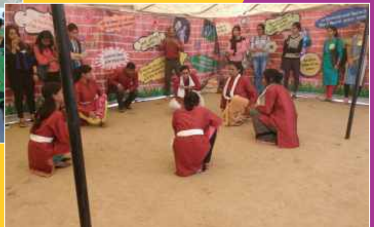
Spreading Awareness on Women's Day