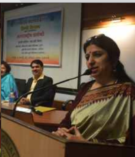
Hindi Dept. International Seminar