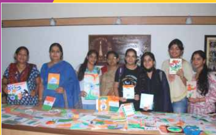
Students' Messages for the keepers of our border