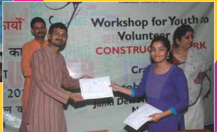
Students getting Certificates at the Craft Mela