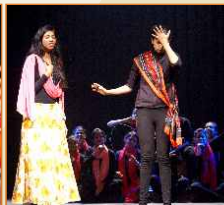
SSI Performance - Mohe Piya Behrupiya