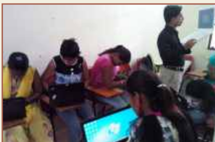
Students' Training program - Hindi Typing Skills