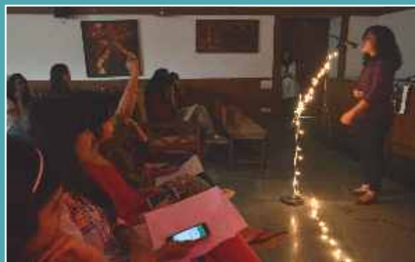
LOGOS Slam Poetry