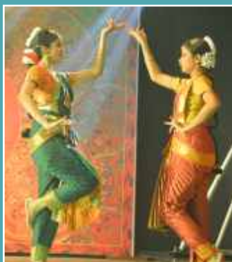
Rhythms of Symphony 2017