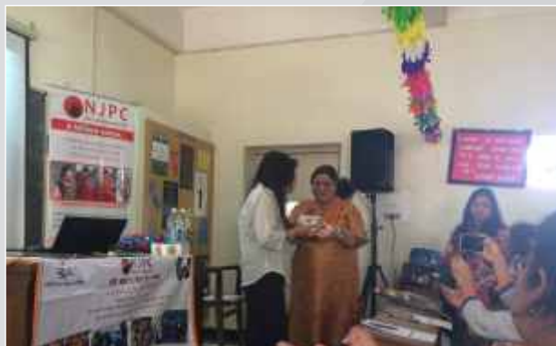
Celebrating International Women's Day