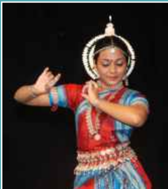
Beauty with Poise

नोट: यू.जी.सी.से प्राप्त सूचना के अनुसार अनु.जा./अनु.ज.जा.ति./व अन्य पि.वर्ग दिव्यांग विद्यार्थी अपने वजीफे के प्रपत्र शैक्षणिक सत्र के फरवरी माह तक जमा करा दें जिससे प्रतिवर्ष छात्रवृत्ति मिल सके।