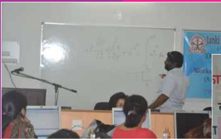
Crunching Numbers- Maths Dept.