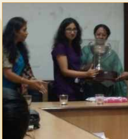
Prize winner of Atul Krishna Binodini Devi Creative Writing Competition