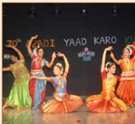
Colours of Peace