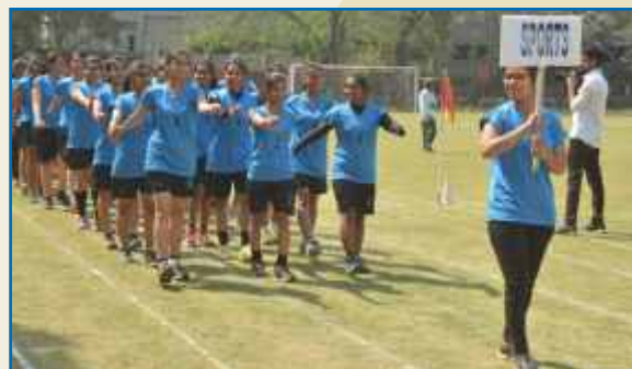
March past - Sports Day