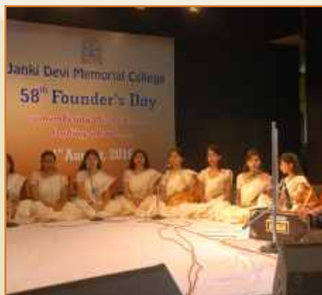
Saarang- Indian Music Society

Note: Students who have not studied music as a subject in class XII, but have an inclination for the subject can opt for music as a part of B.A (Prog.) after appearing in an aptitude test conducted by the Music Department.