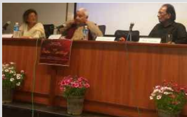
Poetic Montage - English Dept.