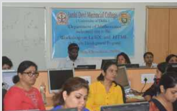
LaTeX - Maths Dept. Seminar