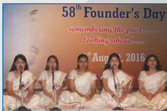
Founder's Day Celebration