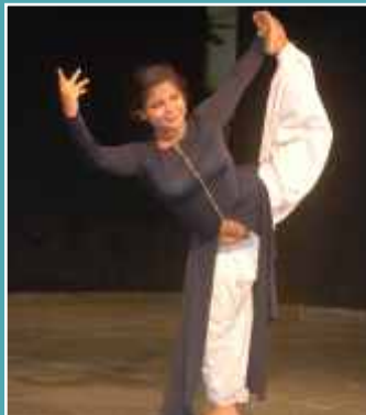
Supple and Agile