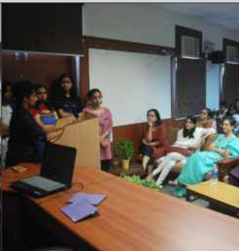
Captivated Audience at the Sociology Dept. Seminar