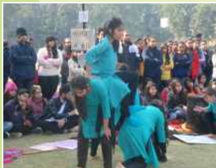
Anubhuti - Street Play Society

गांधी शिक्षा केंद्र : गांधी शिक्षा केंद्र विश्व में व्याप्त आतंक और साम्प्रदायिक हिंसा के विरुद्ध शान्ति और अहिंसामयी गांधीवादी दृष्टि की प्रासंगिकता पर ध्यान केन्द्रित करता है। इस शिक्षा केंद्र से जुड़नेवाले सभी विद्यार्थियों का स्वागत है।