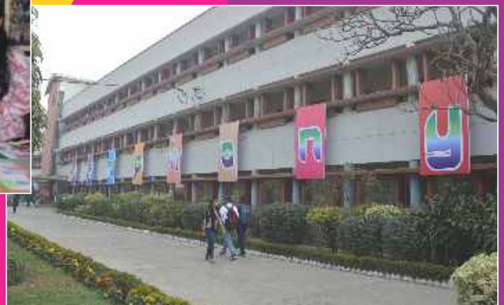
College Fest : Symphony 2017