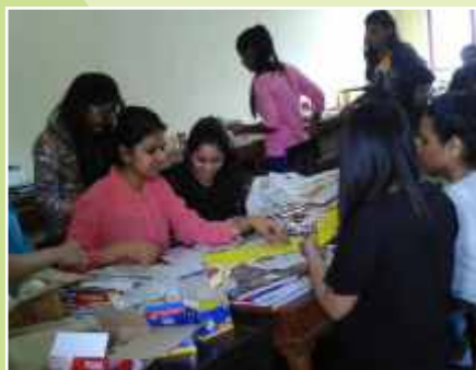
HDFE School of Life Workshop

Women's Development Centre (WDC) : A Women's Development Centre is functioning in JDMC with the assistance from the Department of Women's Studies and Development Centre. It aims to promote, develop and disseminate knowledge regarding the role of women in the present social context.