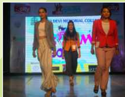
Miss JDMC Contest