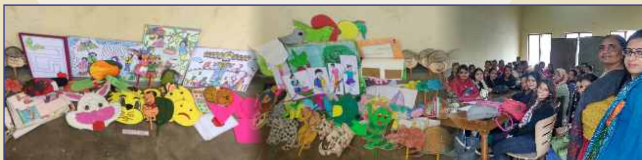
Teaching Aids made by HDFE students