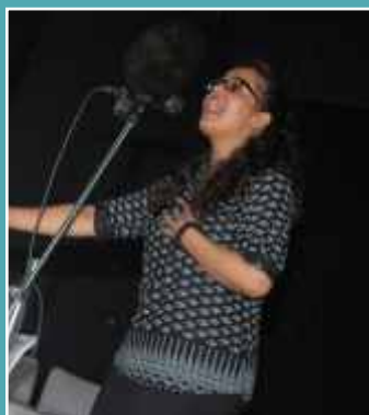
Humming a Cheerful Note- Euphonie

Note: According to the information received from the UGC "The eligible SC, ST, OBC, PWD candidates should submit these Scholarship forms for the academic year by February for processing scholarship to SC, ST, OBC, PwD each year".