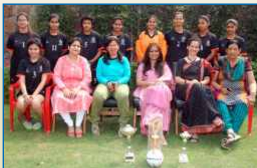
Outstanding Sports Women of JDMC