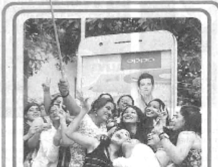
LET ME TAKE A SELFIE: Students pose for a shot on the Selfie Expert OPPO F1s