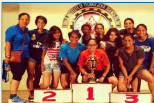
JDMC Winners at BITS Pilani