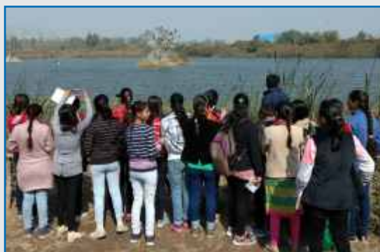
Trip to Yamuna Biodiversity Park