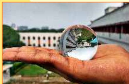
Changing Perspectives- Lumiere