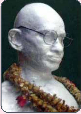
Mahatma Gandhi (1869-1948)