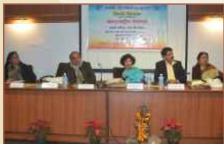
Hindi Dept. International Seminar