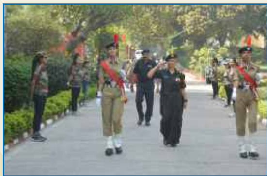
Guard of Honour - NCC Day

The students admitted on the basis of sports will be compulsorily required to participate in sports practice/matches/ competitive events and other such related activities throughout the duration of their stay in the college. Refusal/failure to do so will invite disciplinary action, which may also involve cancellation of admission. Candidates will be required to sign a bond to this effect.