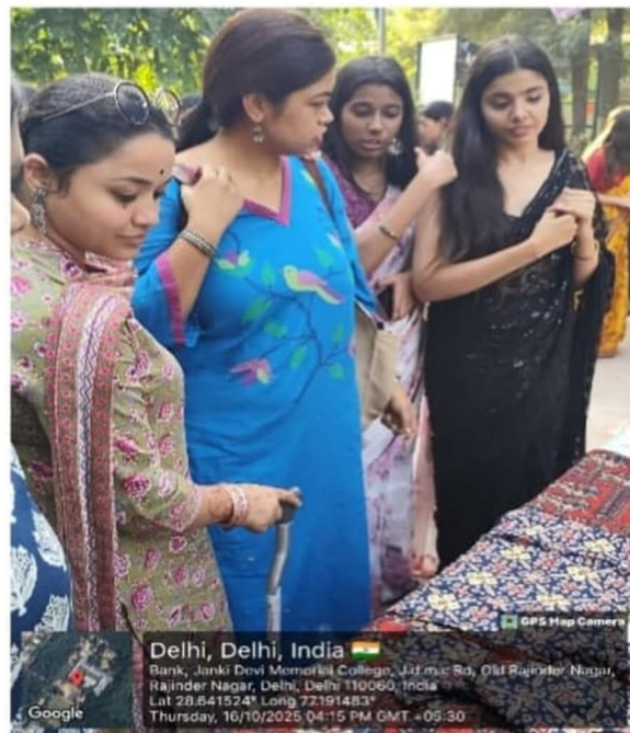
(Our Faculty while visiting the stalls)