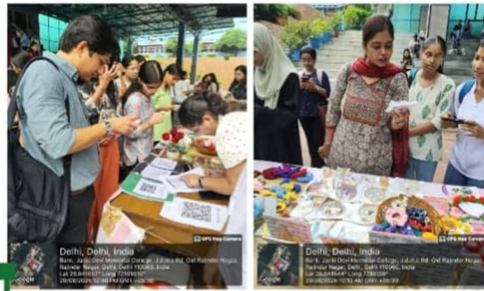
(Teachers visiting our stall)