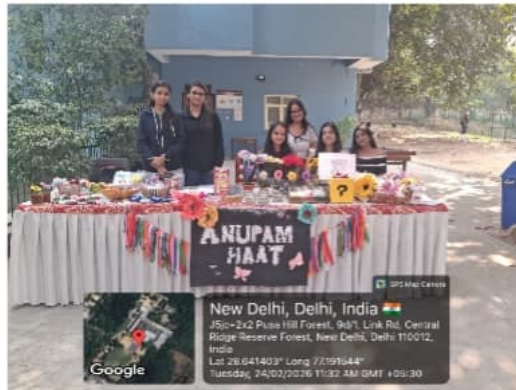
( Our Incubation Core Team)