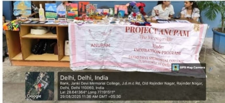
(Our vibrant stall)