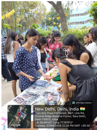
(Crowd at the haat)