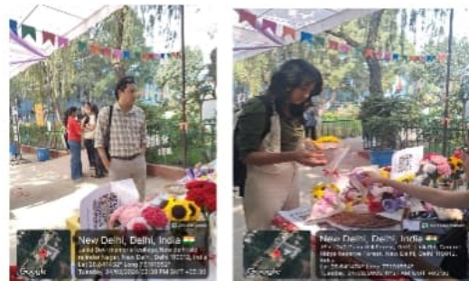
(Our Faculty and Visitors exploring the stalls)