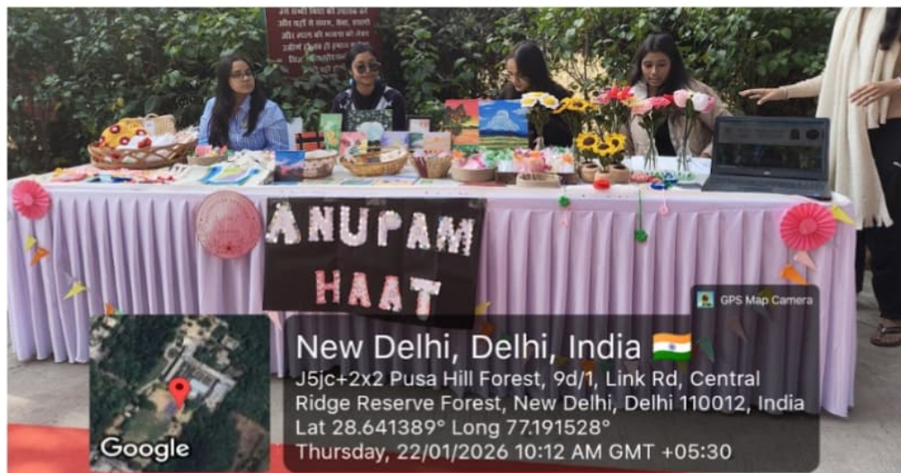
(our vibrant stall)