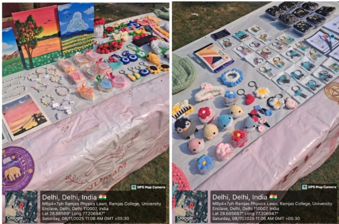
(Our wide range of products)