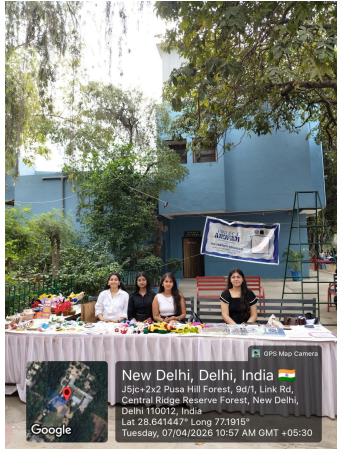
(Anupam Haat Setup)