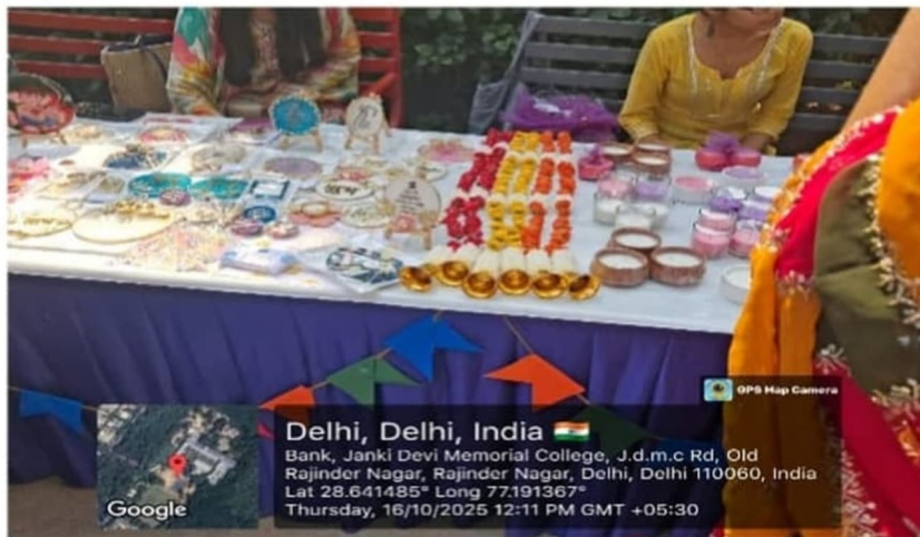
(Our wide range of products)