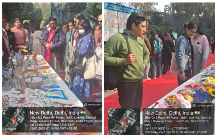
(delegates and teachers interacting with our stall)