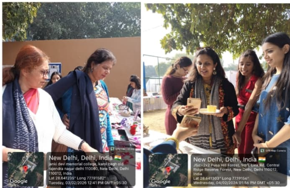
Faculty members visiting the stalls of Anupam Haat