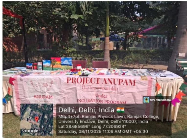
(Project Anupam at Ramjas College)