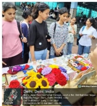
(Student engagement at our stall)