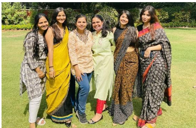
Founding Team of Project Anupam