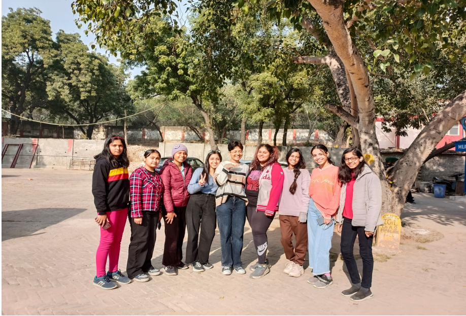
Glimpses from the Second Round of Auditions of Bardolators held on 19 and 20 December 2022