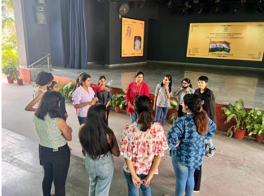
Glimpses from the First Round of Auditions of Bardolators held on 13 and 14 September 2022