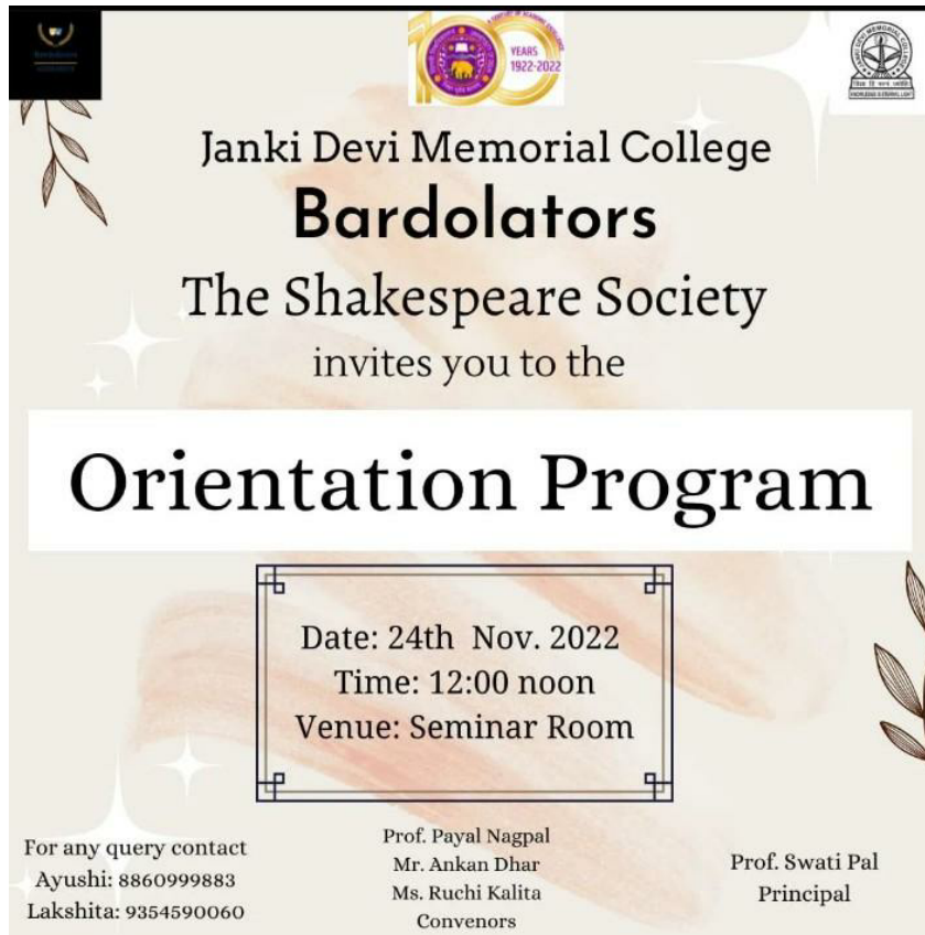
Poster of the Orientation conducted by Bardolators held on 24 November 2022

participate in an impromptu activity which was met with a great response. The Orientation received enthusiastic participation from the students.