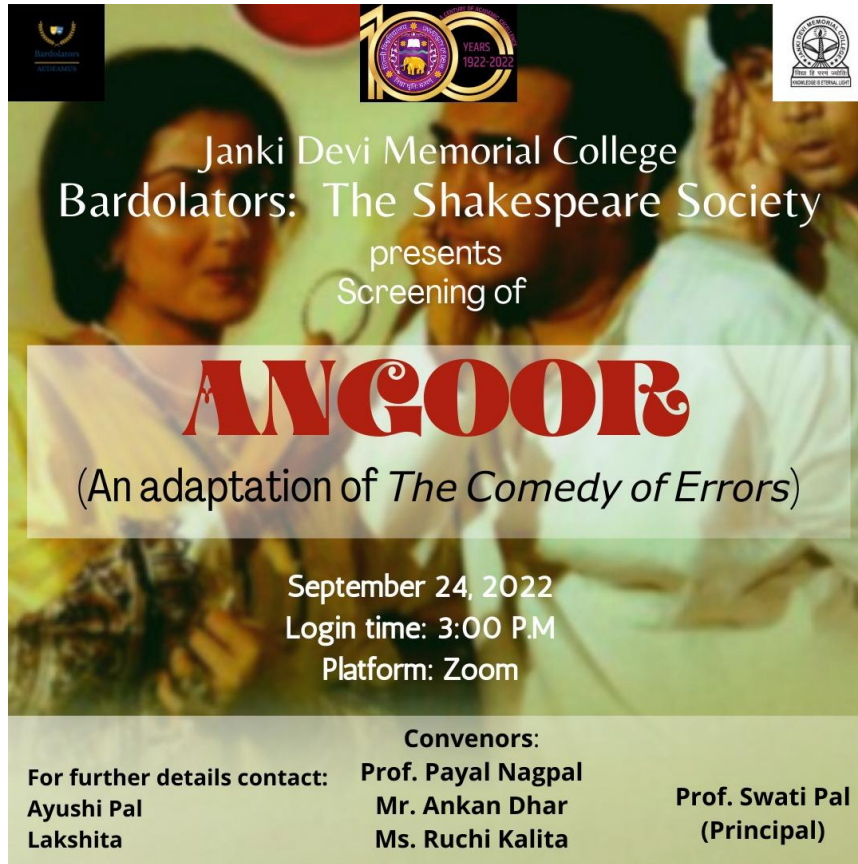
Poster for the Screening of Angoor held on 24 September 2022