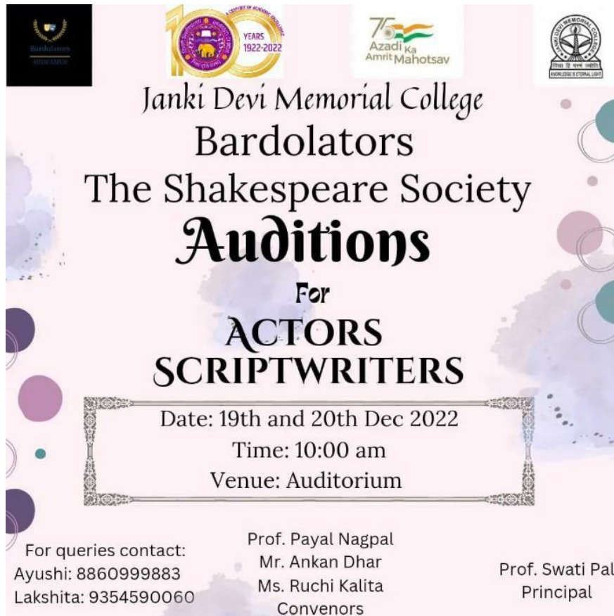
Poster for the Second Round of Auditions of Bardolators held on 19 and 20 December 2022