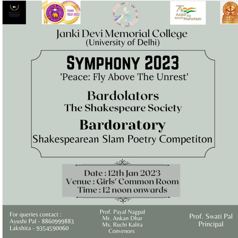
Poster for Bardoratory: Shakespearean Slam Poetry Competition held on 12 January 2023