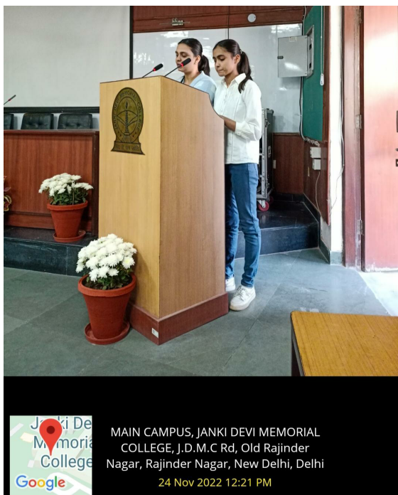
The Student Members addressing the Audience during the Orientation conducted by Bardolators held on 24 November 2022