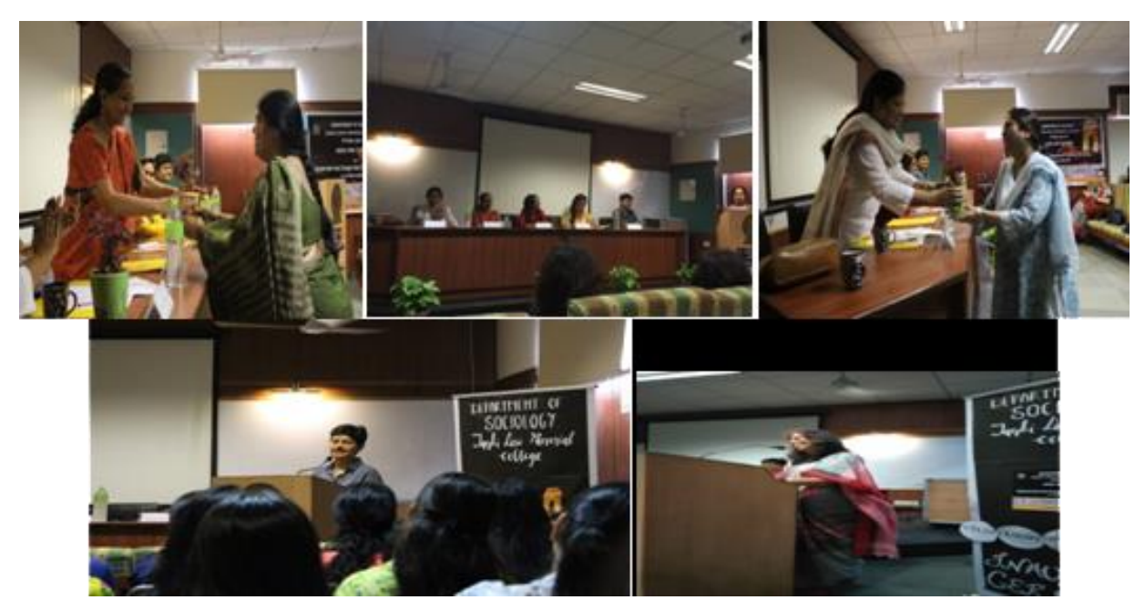
Inaugural Add-on Course August 9, 2018