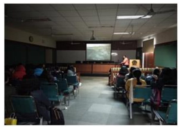
Film -Screening, January 29,2019