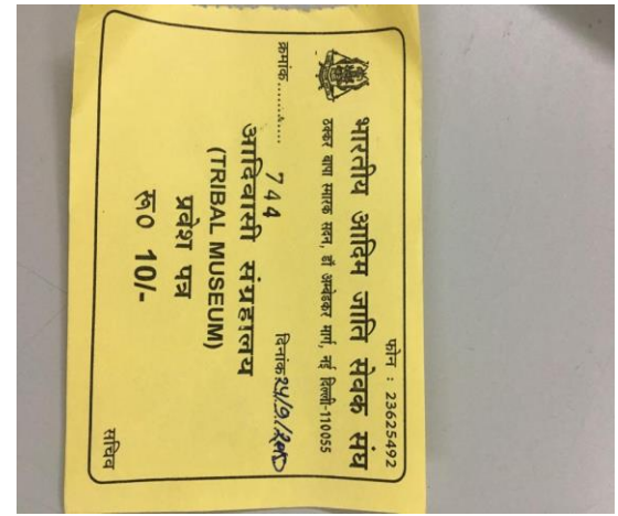
Visit to the Tribal Museum, September 24,2021