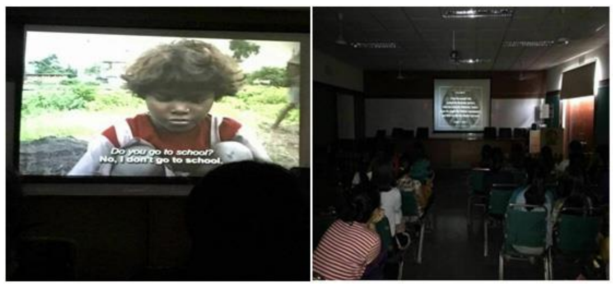
Film Festival August 17, 2018