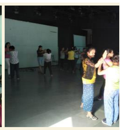
SELF DEFENCE WORKSHOP September 2018