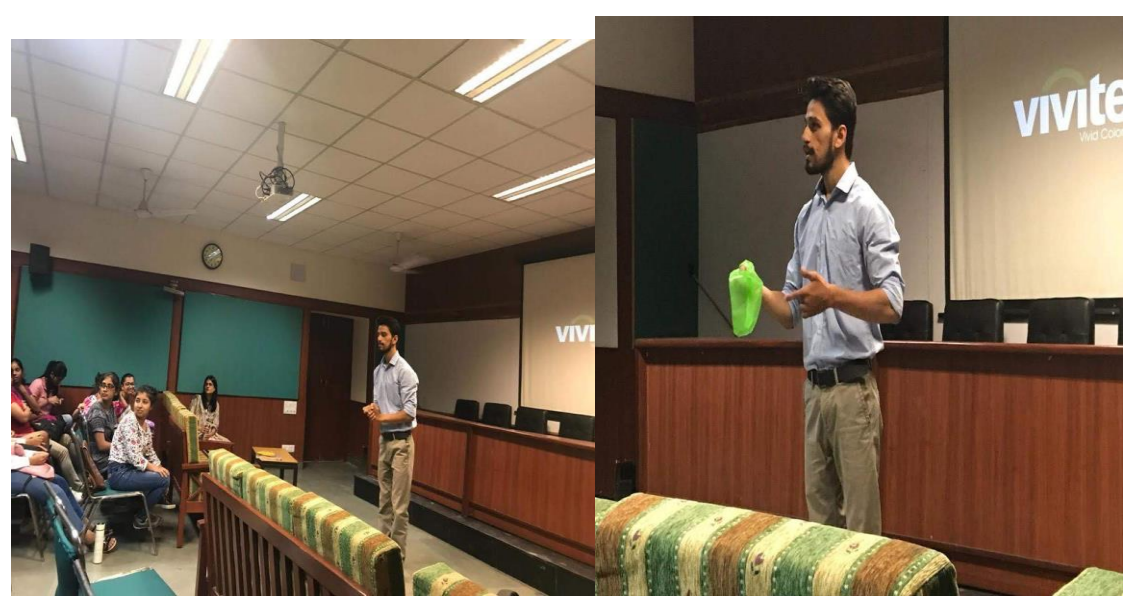
Interactive Session To Fight Plastic Waste, September 22,2018

The Smart Company's green bags are to be sold under the brand name 'smart mom' and 'smart girl'. This led to a healthy debate and discussion between the students and company. A sociologically imaginative and informed understanding of the students became evident as the company was to carry a feedback from them regarding a need to shift to a more gender sensitive brand name as 'smart citizens' for making their green bag project a success.