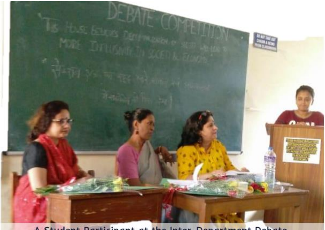
A Student Participant at the Inter-Department Debate Competition with Multi-Department Faculty Members as Judges