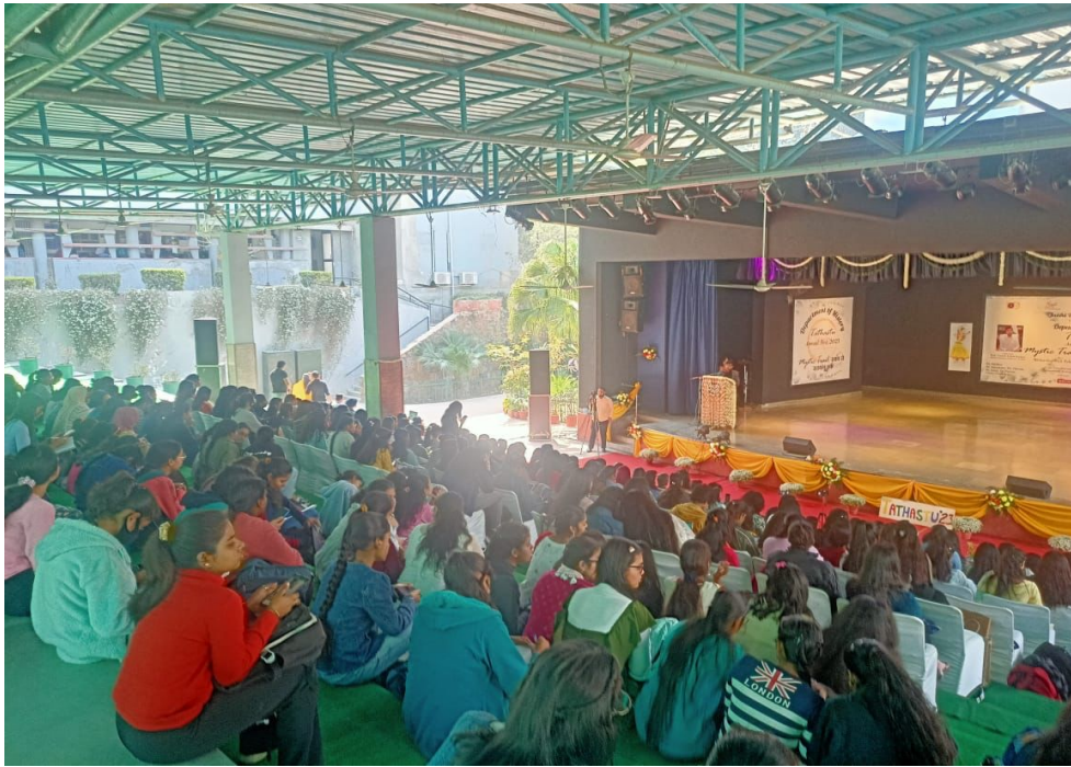
Cultural Performances and Address by Chief Guest at the occasion