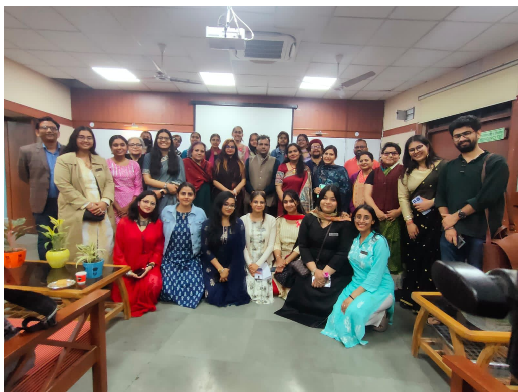
Team Tathasthu, 2023