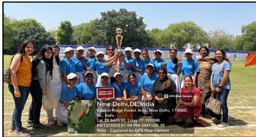
(13.04.2023 -March Past Team Performing)